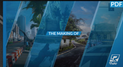
Digital version Making of Ride