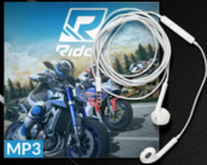
The official game Soundtrack